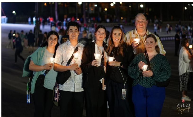
Campbell Parishioners and St Thomas More School teachers at Fatima Candle Procession

Please Note: Watson have their weekday Tues-Fri Masses at 5.30pm.