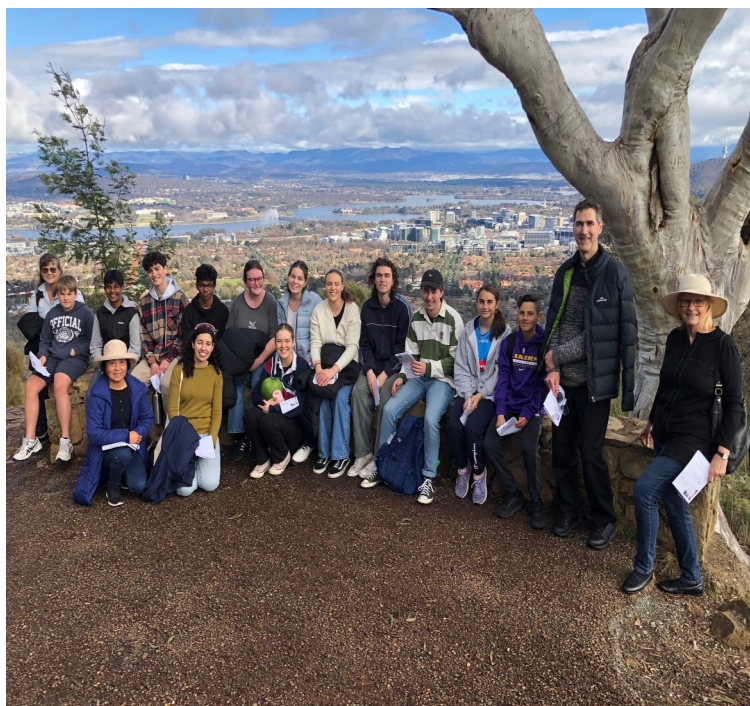
Youth Group climb Mt Ainslie with visiting U-turn Youth Team from The Servants of Jesus from Sydney

Please Note: Watson have their weekday Tues–Fri Masses at 5.30pm.