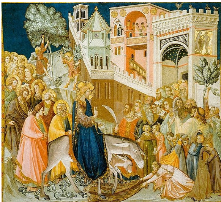
Entry of Christ into Jerusalem', c.1320, Pietro Lorenzetti

Please Note: No 9am Mass Tues & Friday (only a liturgy) at Dickson until further notice. There is a 9.15am at O'Connor; and Watson 8am Tuesdays & 5.30pm Fridays, Next Tues Mass on 4 April. Mass also Easter Monday 10 April