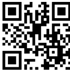
Cathedral QR code

Entrance Antiphon: All that you have done to us, O Lord, you have done with true judgment, for we have sinned against you and not obeyed your commandments. But you give glory to your name and deal with us according to the bounty of your mercy.