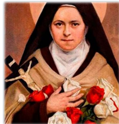
Saint Thérèse of Lisieux 1873-1897