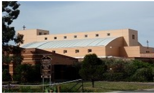
St Monica's Church Deffell St Evatt