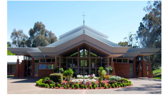
St Michael's Church Tyrrell Cct Kaleen