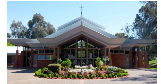
St Michael's Church Tyrrell Cct Kaleen