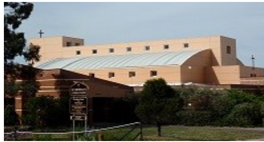
St Monica's Church Deffell St Evatt