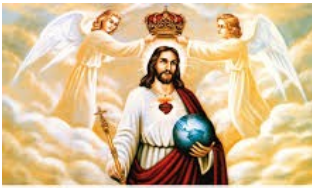
Our Lord Jesus Christ, King of the Universe

WE ACKNOWLEDGE THE TRADITIONAL CUSTODIANS OF THE LAND THE WALBUNJA PEOPLE OF THE YUIN NATION. WE PAY OUR RESPECTS TO THEIR ELDERS, PAST, PRESENT AND EMERGING