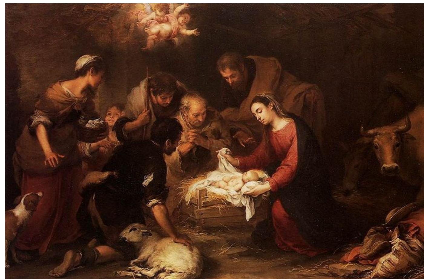
Adoration of the Shepherds, Bartolomé Estaban Murillo

Wishing all St Benedict's parishioners and visitors a happy and holy Christmas