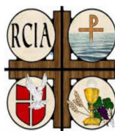
Rite of Christian Initiation for Adults