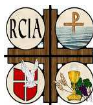
Rite of Christian Initiation for Adults