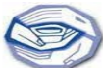
The hand of love offers the cup