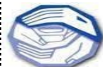
The hand of Christ blesses the cup

DO YOU KNOW... the meaning of the Saint Vincent de Paul Logo?