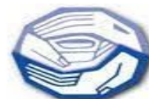
The hand of suffering receives the cup

DO YOU KNOW..... At present the Conference and the Centre are struggling to keep going as no new members/volunteers are joining SVdP, Young?