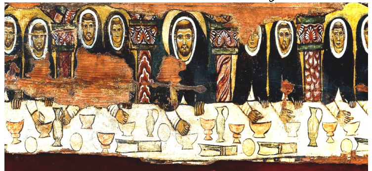
The oldest known portrait of Saint Dominic (detail), c. 1235

This is the earliest portrait we have of Dominic and his companions, and it gives us insight into his understanding of his mission in the Church.