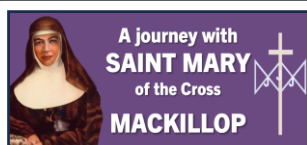
A journey with SAINT MARY of the Cross MACKILLOP

All: God of peace, as we light the second Advent candle of peace, may your peace fill our hearts and our world. Help us to be peacemakers in our relationships and communities. In Jesus' name, we pray. Amen.