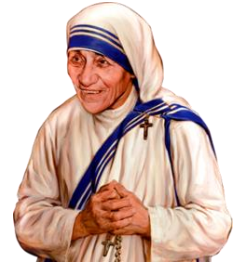
St Teresa of Kolkata Mother Teresa

Prayer makes your heart bigger, until it is capable of containing the gift of God himself. Prayer begets faith, faith begets love, and love begets service on behalf of the poor.