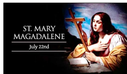
ST. MARY MAGDALENE July 22nd

"We have loved them in Life: Let us not forget them in death."