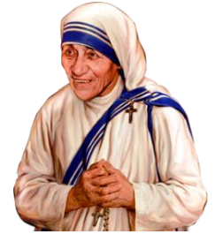
St Teresa of Kolkata Mother Teresa

Prayer begets faith, faith begets love, and love begets service on behalf of the poor.