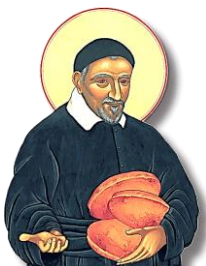
ST VINCENT DE PAUL

ST VINCENT DE PAUL (Feast Day 27 September 2021) was born to a French peasant family in 1580. He was a highly intelligent youth and was educated by the Franciscans for several years, before being ordained at the age of 20. In 1605 he was captured by Turkish pirates who sold him into slavery, but won his freedom after he converted one of his masters to Christianity. After returning to France, he served as a parish priest near Paris and began to establish charitable organizations that helped the poor, nursed the sick and found work for the unemployed.