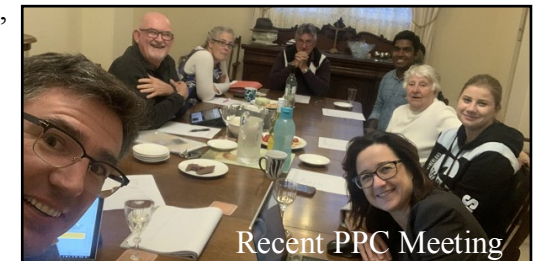
Recent PPC Meeting