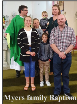
Myers family Baptism.