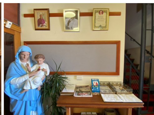
The church foyer looking tidy and neat