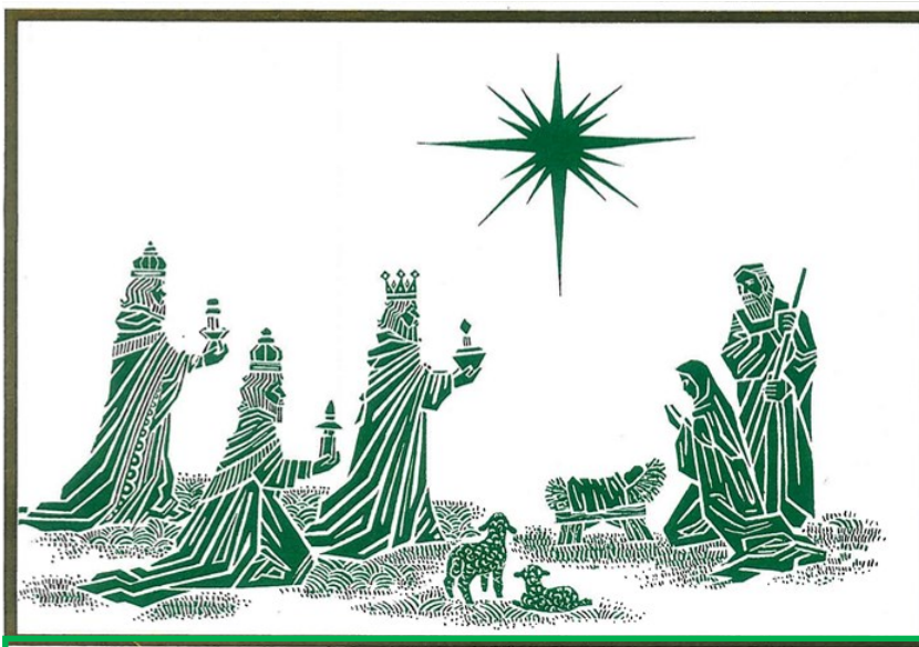
The Magi offered the child Jesus gifts of Gold, Frankincense and Myrrh.

The Greek word Epiphany which means appearance or manifestation, is applied to Jesus' first appearance to the Gentiles in the persons of the Magi. "Epiphany" refers to God's Self-revelation as well as to the revelation of Jesus as His Son. The feast was initially based on, and viewed as, a fulfilment of the Jewish Feast of Lights. Epiphany is an older celebration than the feast of Christmas; it originated in the East in the late second century. The feast commemorates the coming of the Magi as the first manifestation of Christ to the Gentiles in the Western Church. In the Eastern Church, it is also the commemoration of the baptism of Christ where the Father and the Spirit gave combined testimony to Jesus' identity as Son of God. The