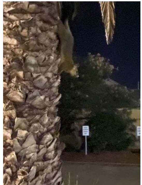
A NOCTURNAL VISITOR