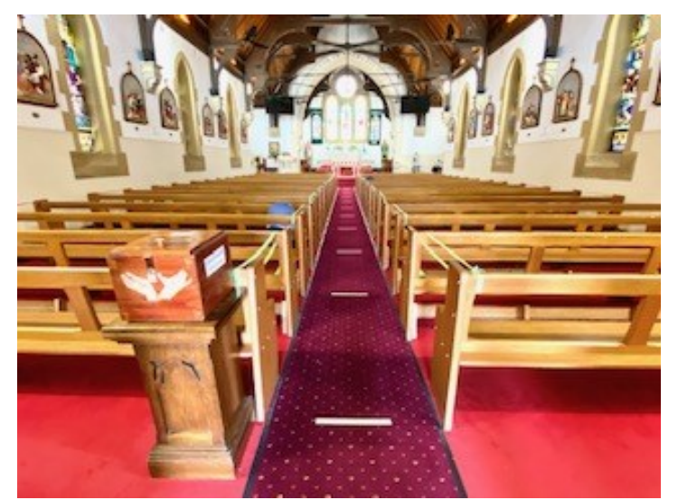
COLLECTION BOX is introduced for the purpose for both collections for weekend Masses. You may place your offering as you enter or leave the church.

I WOULD LIKE TO ACKNOWLEDGE PARISHIONERS WHO CONTRIBUTED TO THIS PROJECT INITIALLY.