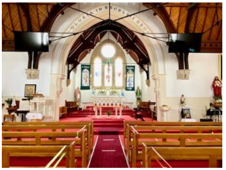
HAPPY FINALLY TO HAVE TWO ELECTRONIC SCREENS INSTALLED, VERY HELPFUL TO THE LITURGY INDEED. Thanks to all who donated towards making this project a reality.